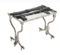
939 Instrument support for stretchers