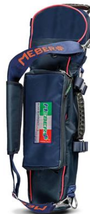
12072/BR "COVER OX 5 BR"- professional cylinder holder for 5 lt oxygen bottles