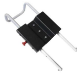
12128 Adjustable system for headrest of Meber-X and Mercury stretchers