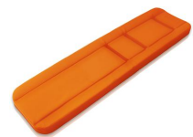
7013/A 3 pcs. Skay fire-proof electrowelded mattress