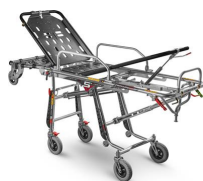
Mercury Cinque 7075/4RG PROOF Certified 5 levels self-loading stretcher with 4 swivel wheels