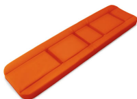
7014/A 4 pcs. Skay fire-proof electrowelded mattress