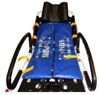
12154 "BEAR PODS" Bariatric containment system for self-loading stretchers