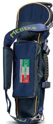
12072/BG "COVER OX 5 BG"- professional cylinder holder for 5 lt oxygen bottles