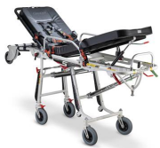
Mercury Lite Cinque 7097/4RG Proof Certified aluminium 5 levels self-loading stretcher with 4 swivel wheels - high version